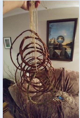
Dream Catchers Crooked River