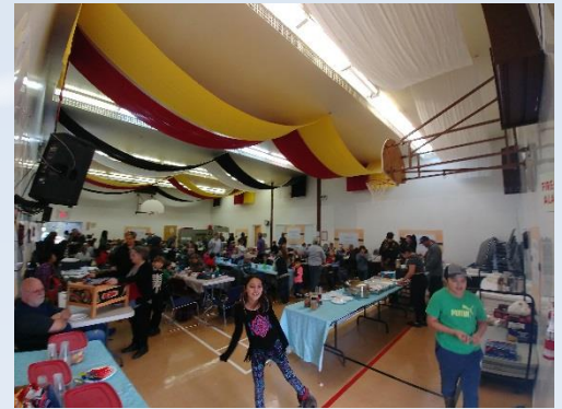
Culture Camp Day