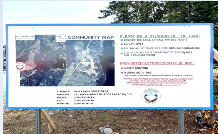
MLIB Trespass Signs

If you are interested in helping translate to Tse'Khene, please contact Tania @ (250) 988-1223.