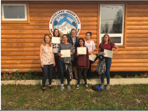
BC hydro's Pathways to Readiness workshop