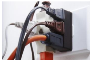
Figure 1 - Overloaded plug

When a circuit becomes overloaded it breaks the circuit breaker. This happens when there are devices such as phones, laptops, gaming systems, televisions, coffee pots, hair dryers and surround sound systems all