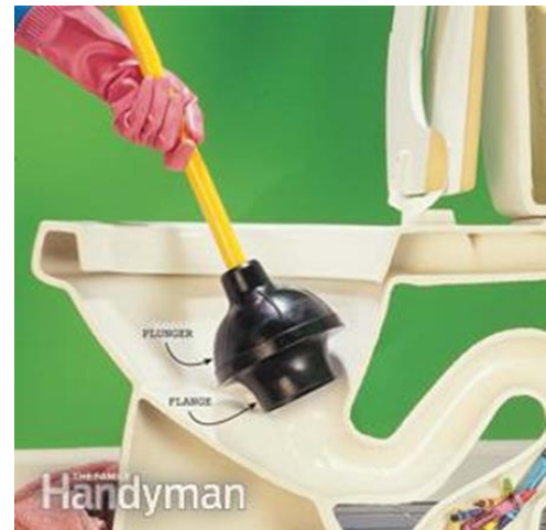
Figure 8 - Grab the plunger