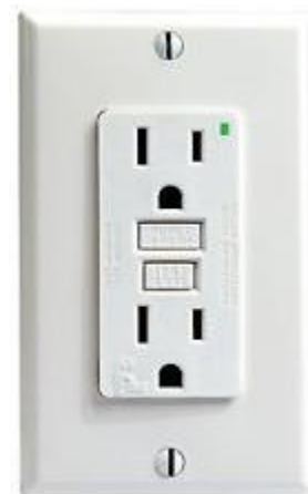
Figure 3 G.F.C.I plug

If the GFCI receptacle is working properly, pushing the “test” (bottom) button will cause the top button to pop out. You should hear a sharp “click” upon pressing the test button. After you have pressed the reset button, check to see if all your plugs are now working.